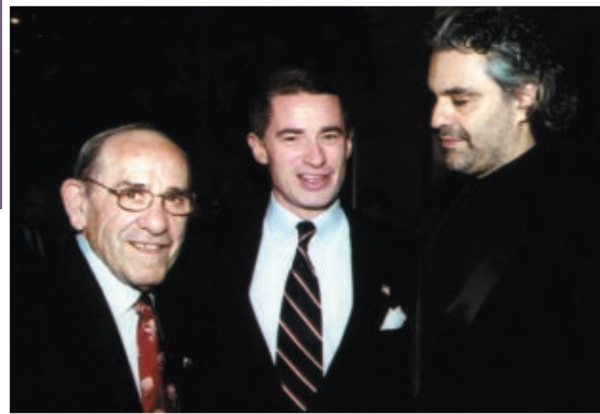
Yogi Berra, Governor James E. McGreevey and Andrea Bocelli at the post-concert reception.