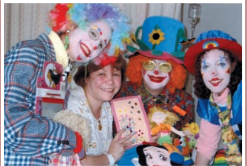
The clowns spread their cheer wherever they go!

Clara Maass Medical Center is committed to providing the most advanced and comprehensive healthcare to our patients. Total care includes giving patients not only the best medical treatment possible but also creating a healing environment. The clowns' visit contributed to Clara Maass Medical Center's goal of creating a curative and positive environment.