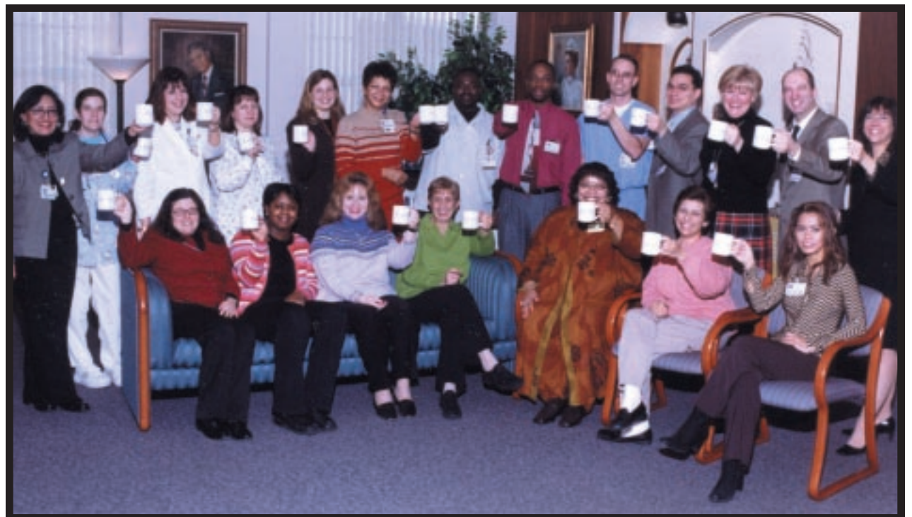
Employee Campaign Committee toasts their success

Clara Maass employees give back to the Medical Center and to their fellow employees through the Employee Campaign, which is managed by the Foundation. This year's Employee Campaign, Reach for the Stars! has reached a record-setting 53% employee participation. Over the past two years, Clara Maass employees have donated over $150,000 to the Medical Center. Contributions to the Employee Campaign go directly to the Capital Campaign and the Employee Sunshine Fund. The Employee Sunshine Fund helps employees experiencing a personal crisis by providing confidential financial assistance. By contributing to the Employee Campaign, employees are making an investment, not only in the Medical Center itself, but also in the well-being of their colleagues.