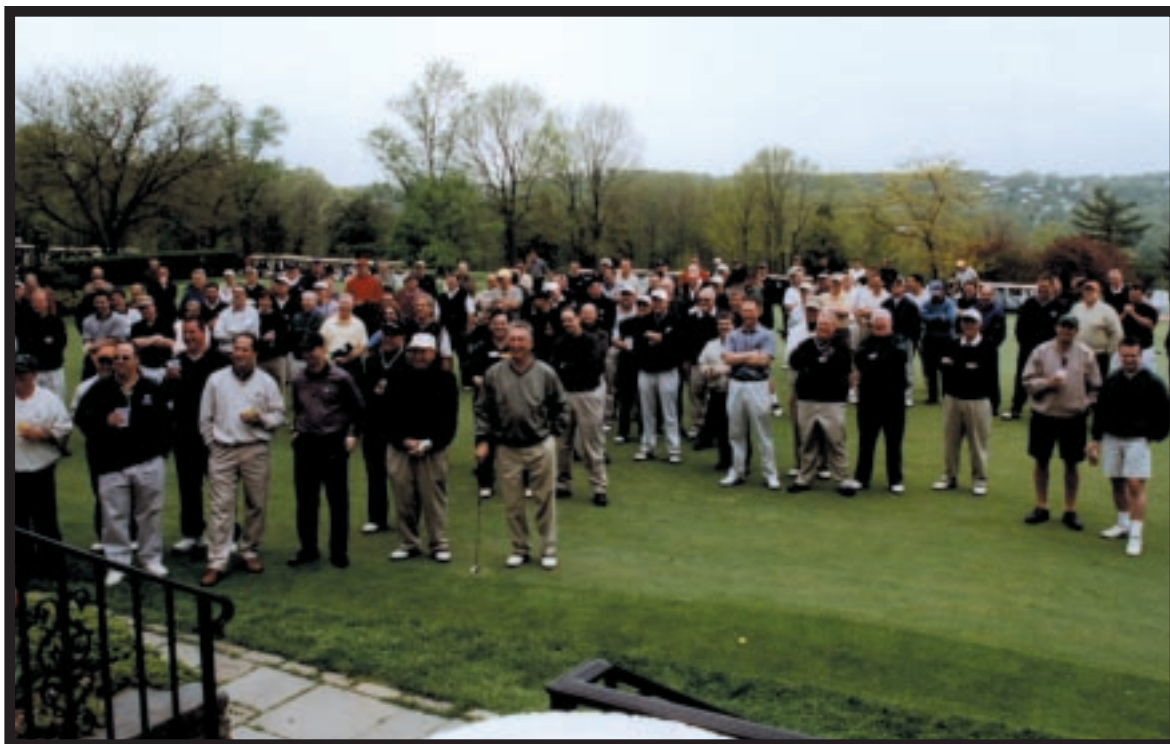
200 CMMC golfers listening to final instructions before the shotgun start of the 2003 Golf Invitational.